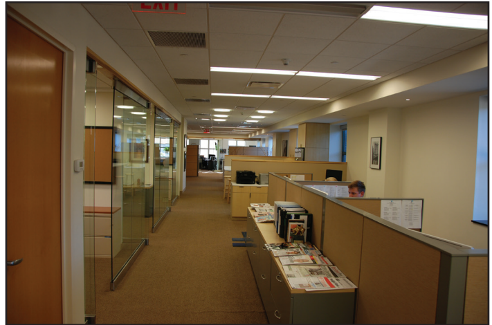
East end looking west