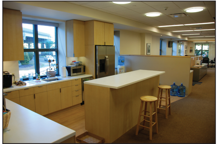
Pantry / Kitchen